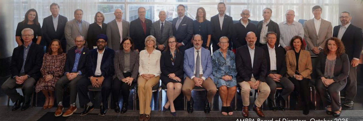
AMRPA Board of Directors, October 2025

The AMRPA website contains members-only resources, including access to information, presentations, data, and other materials, such as our IRF Review Choice Demonstration (RCD) hub page, toolkits for challenging Medicare Advantage denials and IRF Quality Reporting Program (QRP) penalties, analysis of key annual rulemaking for rehabilitation hospitals, AMRPA's Membership Directory and Congressional Search Tool, and much more.