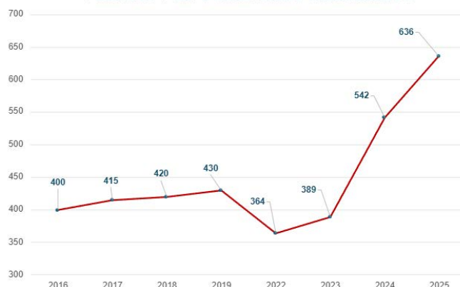
AMRPA Fall Conference Attendance

*In 2020 and 2021 AMRPA Fall Conferences were virtual due to COVID pandemic.